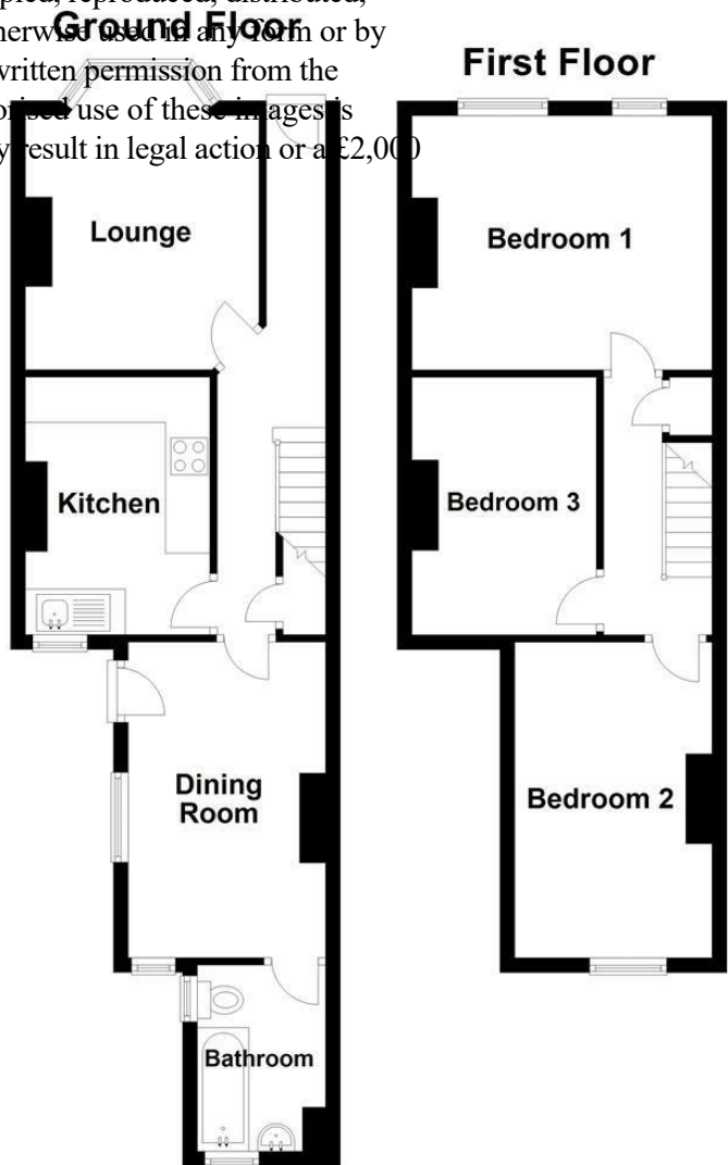
Not to scale. For illustrative purposes only

No photograph may be copied, reproduced, distributed, altered, transmitted, or otherwise used in any form or by any means without prior written permission from the copyright owner. Unauthorised use of these images is strictly prohibited and may result in legal action or a £2,000 fine.